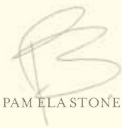
PAMELA STONE, Master Gardener

Take advantage of the sweet corn at the market! Brush corn with olive oil, sprinkle salt and pepper and lightly grill. Remove from the cob, add chopped tomatoes, basil, purple scallions or purple onion, a splash of aged balsamic, salt and pepper. Enjoy!