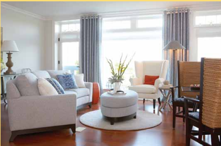
The spacious living area provides extraordinary views of the ocean.