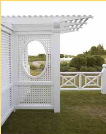
(L) The flourishes beneath the mantle roll under like the crashing waves. (R) The gate to your private terrace overlooks the sand and sea beyond.