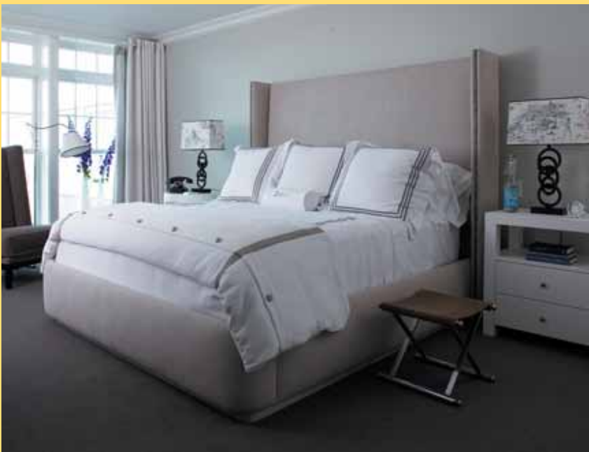
Let this gracious bed envelop you as you listen to the waves just beyond your window.