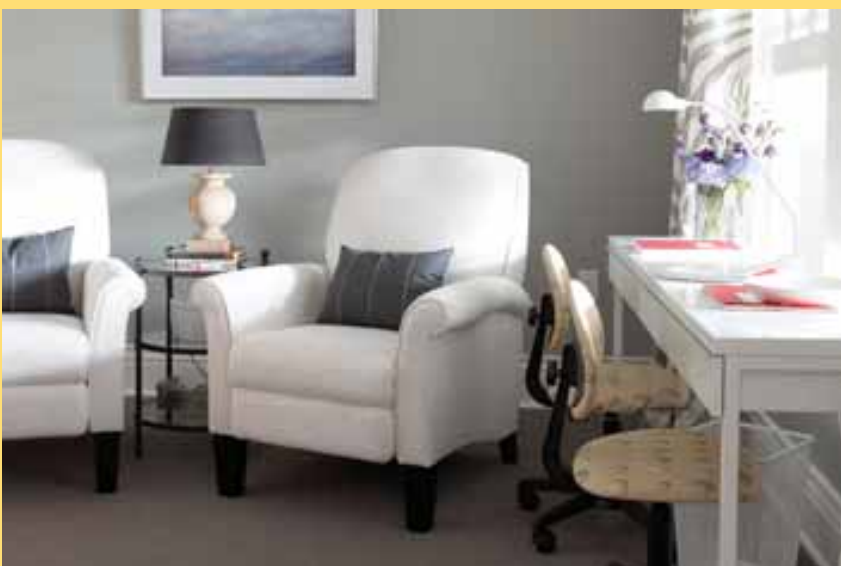
Enjoy a classic movie by the sea, with the beach just steps away from your door.